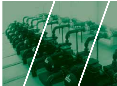
Boosting & Distribution