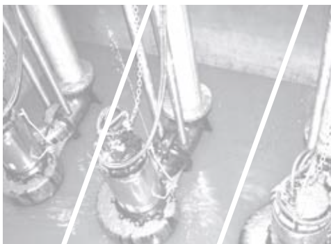
Transport & Treatment