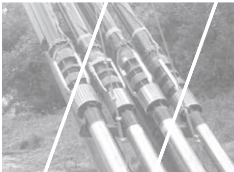
Collection & Distribution

CAPRARI SPA Modena (Italy) • CAPRARI FRANCE SARL Maurepas - Paris (France) • BOMBAS CAPRARI SA Alcalà de Henares Madrid (Spain) • CAPRARI PUMPS (U.K.) LTD Peterborough (United Kingdom) • CAPRARI PUMPEN GMBH Fürth/Bayern (Germany) • CAPRARI PORTUGAL LDA Santarém (Portugal) • CAPRARI PUMPS AUSTRALIA PTY LTD Beverley SA (Australia) • CAPRARI HELLAS SA Thessaloniki (Greece) • CAPRARI TUNISIE SA Ben Arous (Tunisia) • CAPRARI PUMPS (SHANGHAI) CO LTD Shanghai (People's Republic of China) • CAPRARI PUMPS NEW ZEALAND Christchurch (New Zealand)