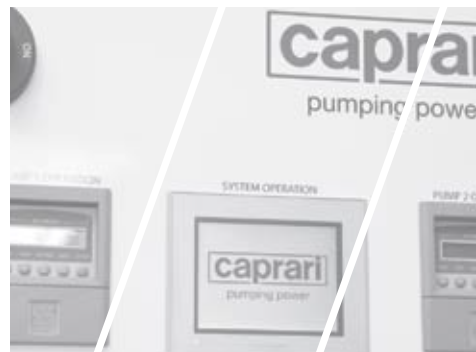
Pump Control Technology